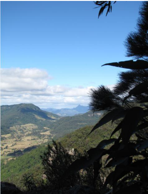
Outlook to Mt Warning from Mt Merino