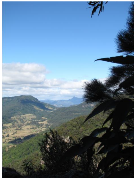
View to Mt Warning from Shipstern